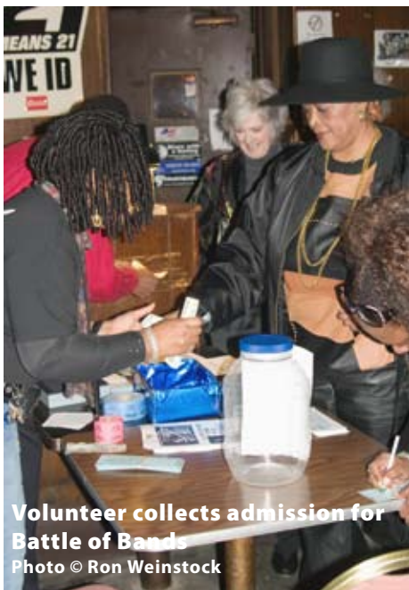
Volunteer collects admission for Battle of the Bands.

"Ain't nobody," bluesman Harmonica Fats once told me as we sat at the bar of the Café Lido in Newport Beach, "gonna get rich playing blues."