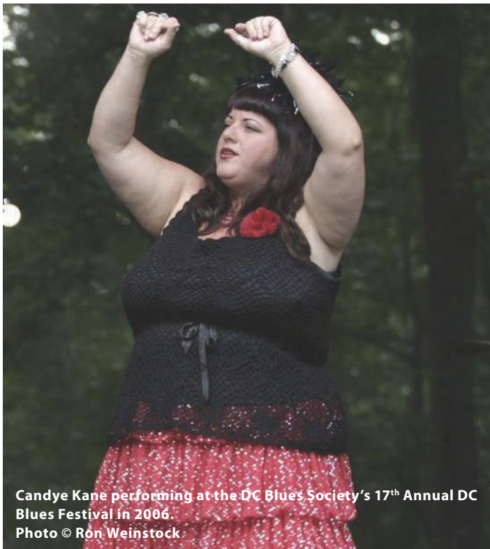
Candye Kane performing at the DC Blues Society's 17 th Annual DC Blues Festival in 2006.

the hospital. I felt like it was important to do this, because if something did go wrong in surgery, (which it won't!!!) at least I have recorded some of my all time favorite songs. I know everything will be fine but it felt so special and heartwarming to have my musician friends rally around me and donate their talents and studio time for free. I am one lucky girl."