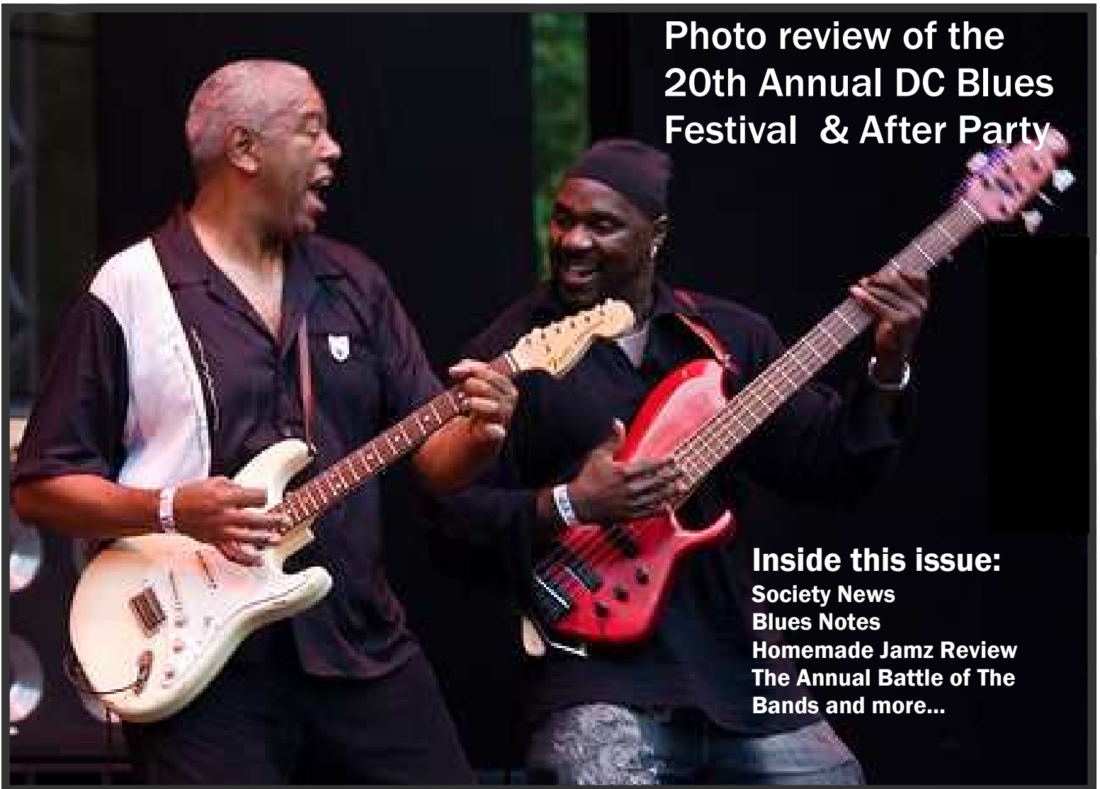
Photo review of the 20th Annual DC Blues Festival & After Party

Inside this issue: Society News Blues Notes Homemade Jamz Review The Annual Battle of The Bands and more...