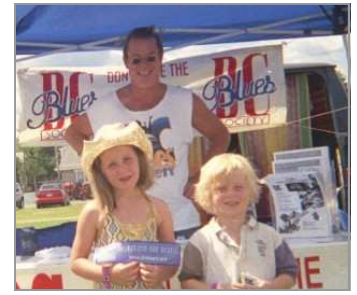
Volunteers and Blues fans at Safeway BBQ Festival (left) and Billtown Blues Festival (right).