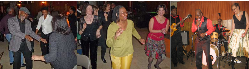
Kingsnake