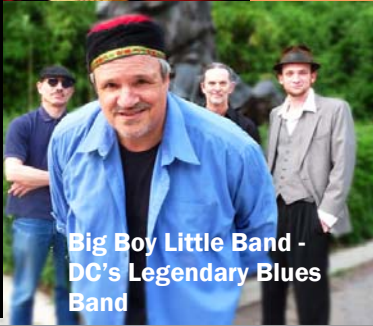
Big Boy Little Band - DC's Legendary Blues Band