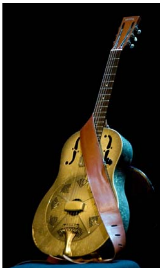
"'Spook' just a sittin' and waitin'".