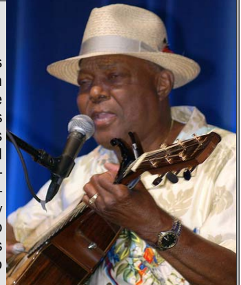
Blues music is truth...John Cephas

Happy Birthday, John Cephas We thank you for this wonderful festival