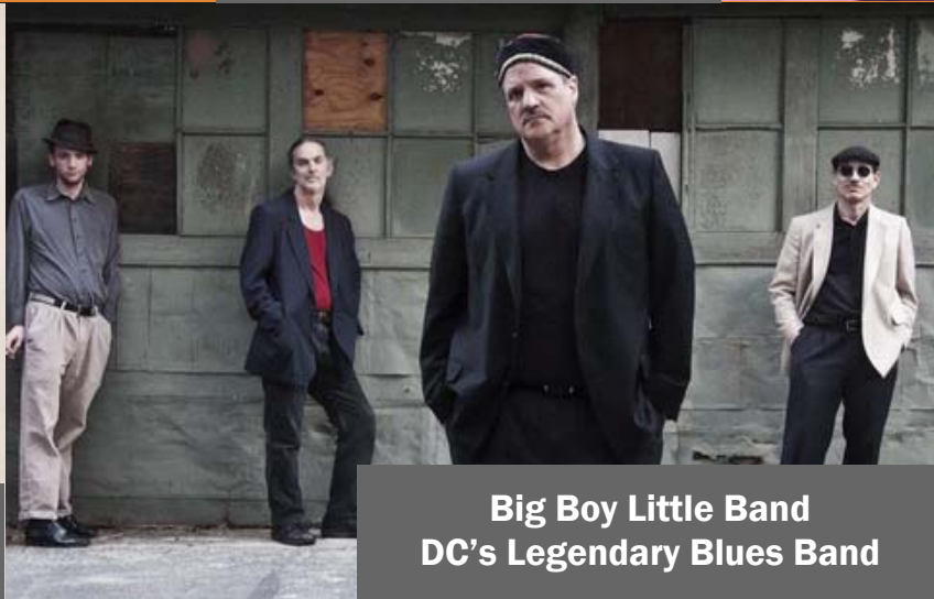
Big Boy Little Band DC's Legendary Blues Band