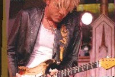
KENNY WAYNE SHEPHERD