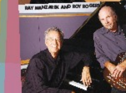
RAY MANZAREK AND ROY ROGERS