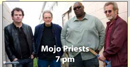
Mojo Priests 7 pm

Winner, DC Blues Society's 2014 Battle of the Bands!