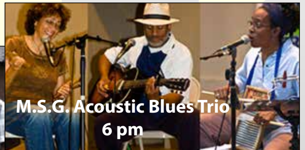
M.S.G. Acoustic Blues Trio 6 pm