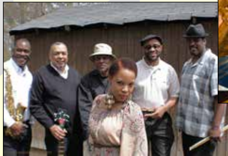
DC Blues Society Band 8 pm