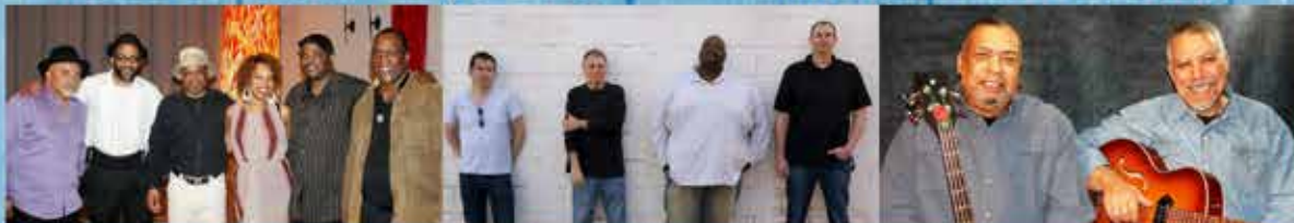
Full Power Blues