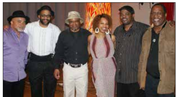
Full Power Blues