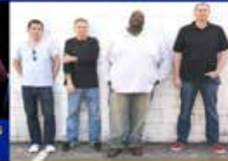
The Mojo Priests (2014) DC Mudd (2015)

Purchase Advance Tickets & Save! DCBS Members: $12 advance/$15 door Non-members: $15 advance/$18 door Not a member or need to renew? Do it on-line!