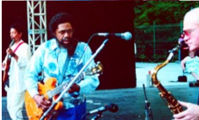
Son Seals on guitar at the D.C. Blues Festival in the mid-nineties.

sion ad for Olympia beer. A strong series of six more successful Alligator releases followed through the 1980s and 1990s, growing Son's audience from a few hundred into many thousands. He became a favorite of critics everywhere. "Excellent modern blues," exclaimed Blues & Rhythm. Musician declared Seals delivers "performances of the most profound emotion...one of the genre's most soulful exorcists." But it wasn't just the critics. Fellow musicians -- from inside and outside of the blues world -- took notice of Seals' immense talents.