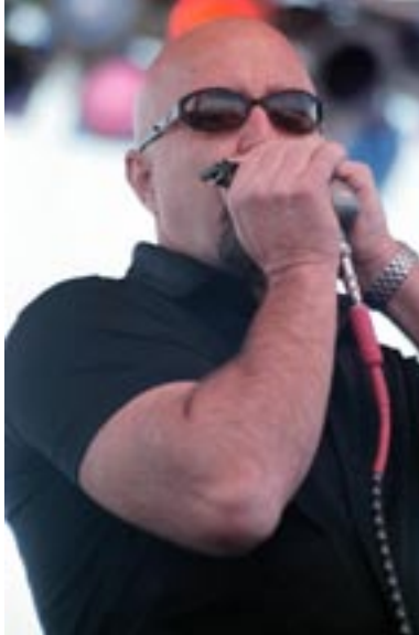
Kim Wilson leads The Fabulous Thunderbirds at the National Capital Barbecue Battle, Saturday June 24.

This list will be updated next month. Volunteers needed to help out at the Blues Society booths at the Western Maryland Blues Festival, Columbia Pike Blues Festival, the National Capital Barbecue Battle (Sunday), Hot August Blues. Of course we will need volunteers for the DC Blues Festival. Please call the hotline or email volunteer@dcb Blues.org if you can volunteer for any of these events.